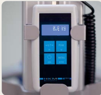
5 Optional: Digital patient scale, not calibrated.