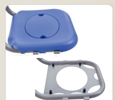
10 The PUR padding is easily slid onto the stainless steel frame and can be removed at any time.