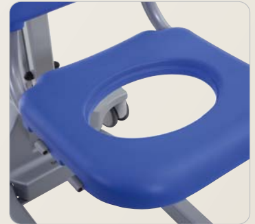
6 Seat area with large, lockable hygiene opening.