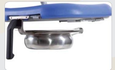
8 Optional: Bedpan support for inserting your in-house bedpan.