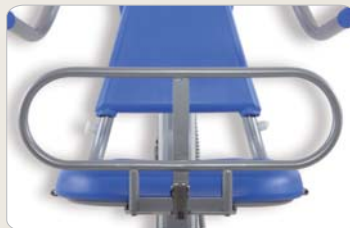
7 Optional: Side rail for plugging into a bracket at the seat with safety lock.