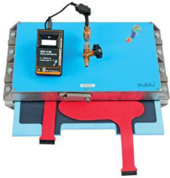
trublu® calibration device

With the aid of the trublu® calibration device, all sensors of the pedar® system are individually calibrated using a known air pressure. This procedure is computer-assisted and can be performed in a short time.