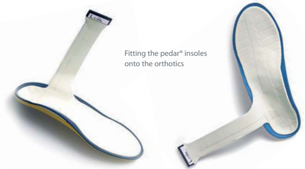
Fitting the pedar® insoles onto the orthotics