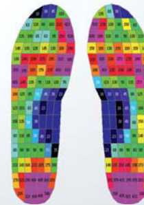
Maximum pressure picture