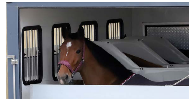
The cryotherapy cabin for equines can be mounted in fixed installation (box) or mobile (van, truck, trailer ...).

Overall length: 4.30 m Internal length: 3.16m Total width: 2.13 m Internal width: 1,67 m Loading height = 2,26 m Net weight = 920 kg Brutto weight = 2 600 kg