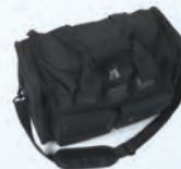
4665009625 Rental Bag