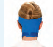
4665009534 Occipital (Back of Head) Relief Pad