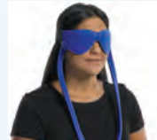
4665009542 Eye Relief Pad