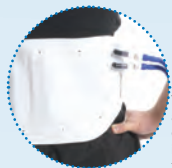
The single patient Disposable pads are durable and prevent the transfer of germs and bacteria. Pad interior is coated plastic which helps prevent fluid transfer and contamination.