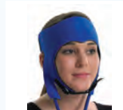
4665009526 Front & Side Head Relief Pad