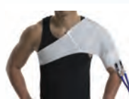
4665009683 Shoulder Relief Pad Fits up to a 54" Chest

Durable, yet disposable to prevent the transfer of germs and bacteria. Pad interior is coated plastic which helps prevent fluid transfer and contamination.