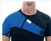
4665009550 Shoulder Relief Pad Fits up to a 44" Chest 4665009592 – Large Shoulder Relief Pad Fits up to a 54" Chest