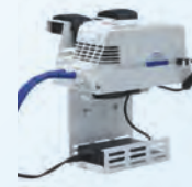
4665009633 Hospital Bed Bracket