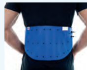
4665009576 Back, Abdomen, Hip Relief Pad