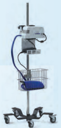
4665009641 IV Pole with Basket

Kinetec SAS Zone Industrielle de Tournes Rue Maurice Périn F-08090 Tournes France