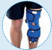
The single patient Deluxe neoprene pads are interchangeable, universal and fit right or left side.

Kinetec Kooler™ is a powerful and practical pain relieving device that uses thermoelectric technology to provide heating and cooling therapy where and when you need it, without the use of ice. Our technology satisfies a clear un-met clinical need - safe, effective, and targeted localized treatment with precise temperature management and registration.