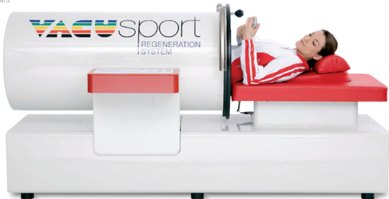
IVT with the VACUSPORT® increases the attractiveness and rentability of medical facilities.

Due to the excellent effect of IVT on lymph flow, the VACUSPORT® Regeneration System is also recognised as a modern, cost-effective therapy for lymphoedemas.